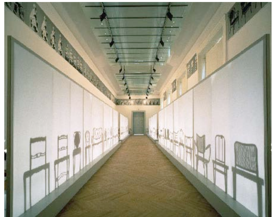
Bentwood chairs by Michael Thonet in the permanent collection of MAK, Vienna. Exhibition design by Barbara Bloom, including translucent walls, lights, photo frieze and screenprinted text labels, 1994