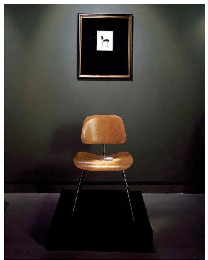
Barbara Bloom Pride from 'The Seven Deadly Sins', 1987, framed photograph in velvet mount, molded plywood Lounge Chair Metal by Charles and Ray Eames, calling card engraved with the word 'pride' on seat